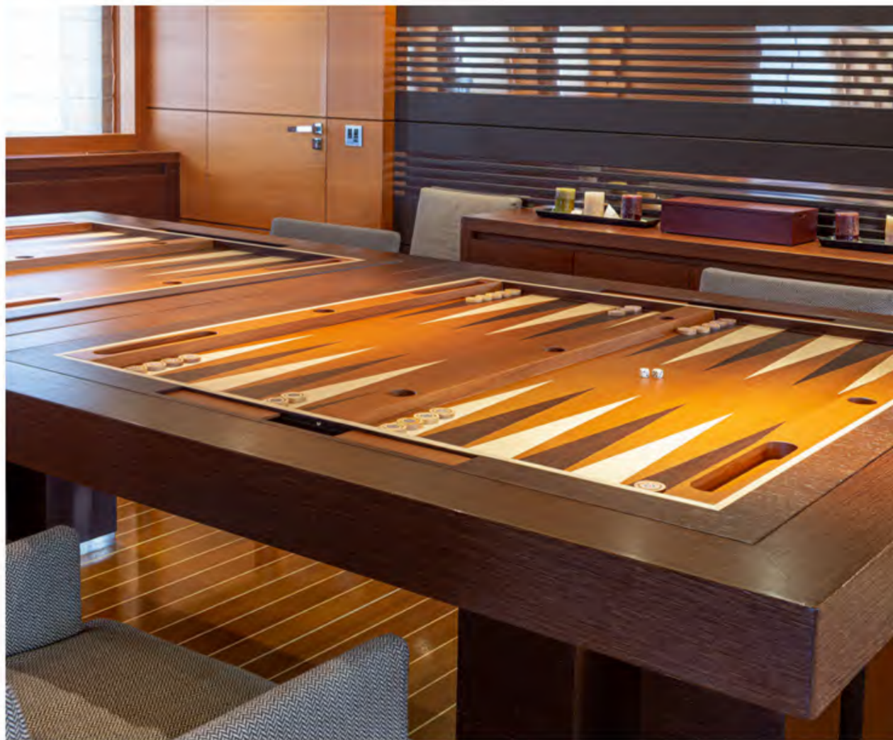
The dining table at the main deck can be converted into a backgammon table ■