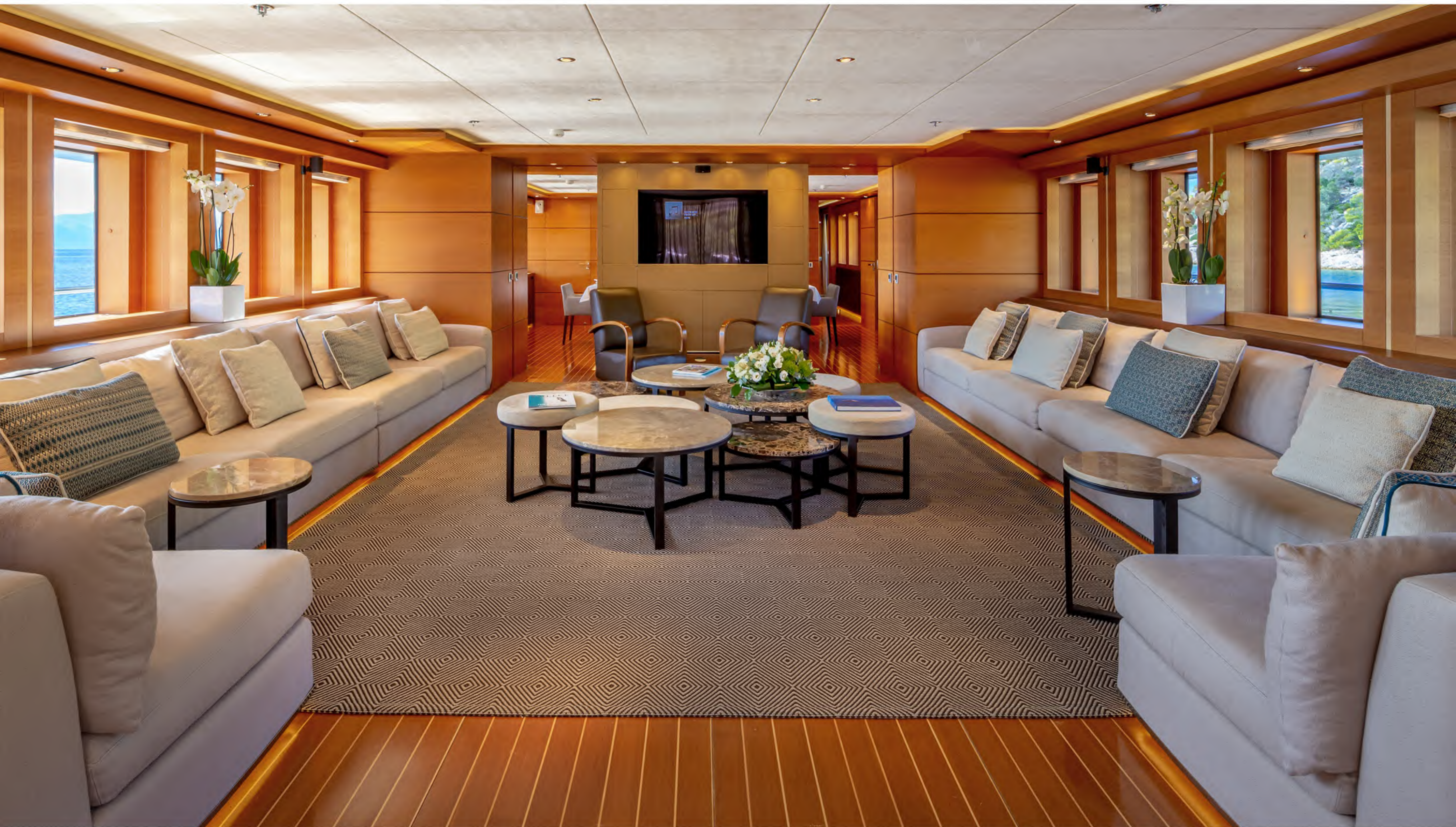
The choice of a contemporary, almost minimalist design contrasting with exquisitely tasteful furniture makes ZALIV III unique and original