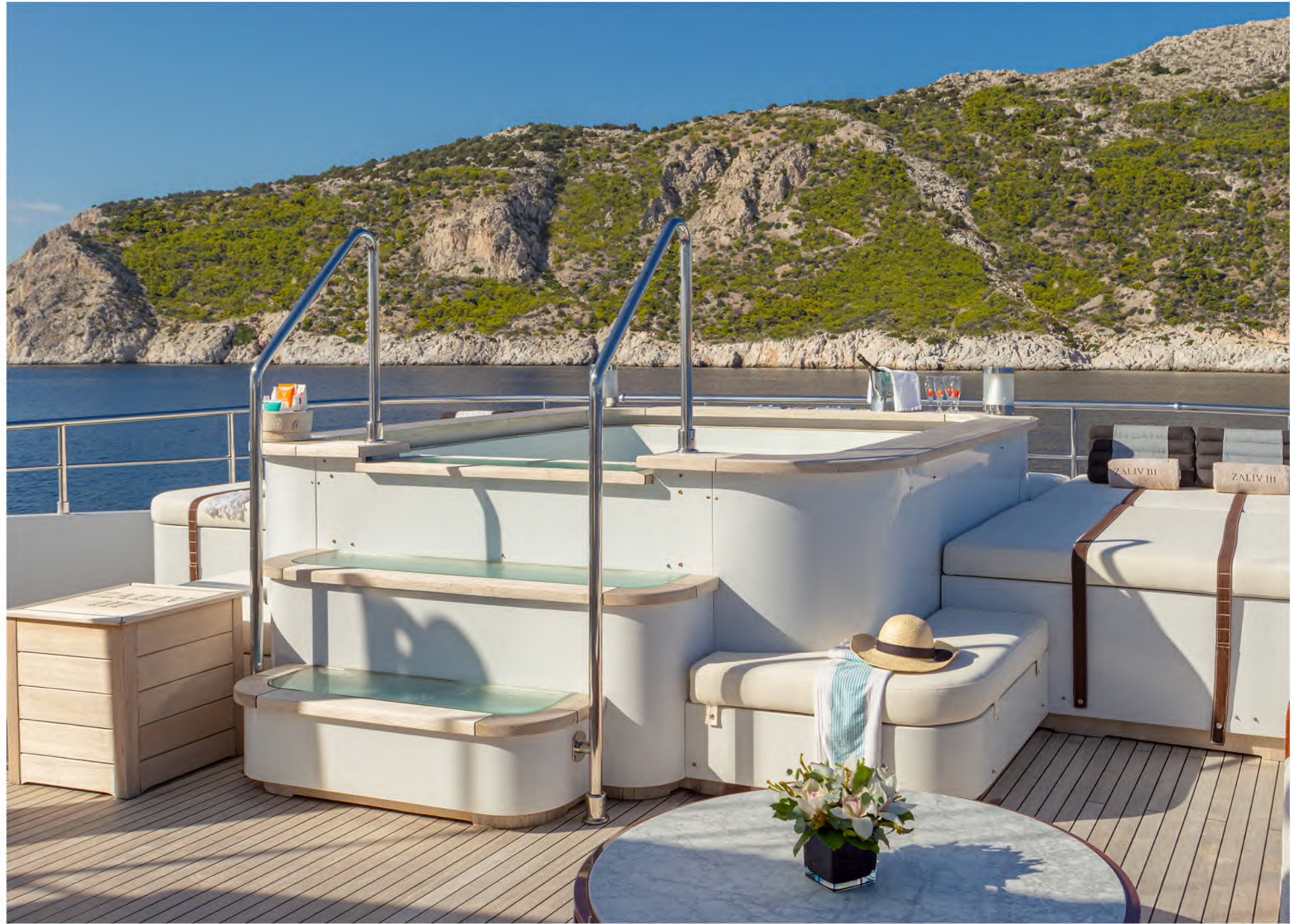
The large jacuzzi is the ultimate place for relaxation providing spectacular views