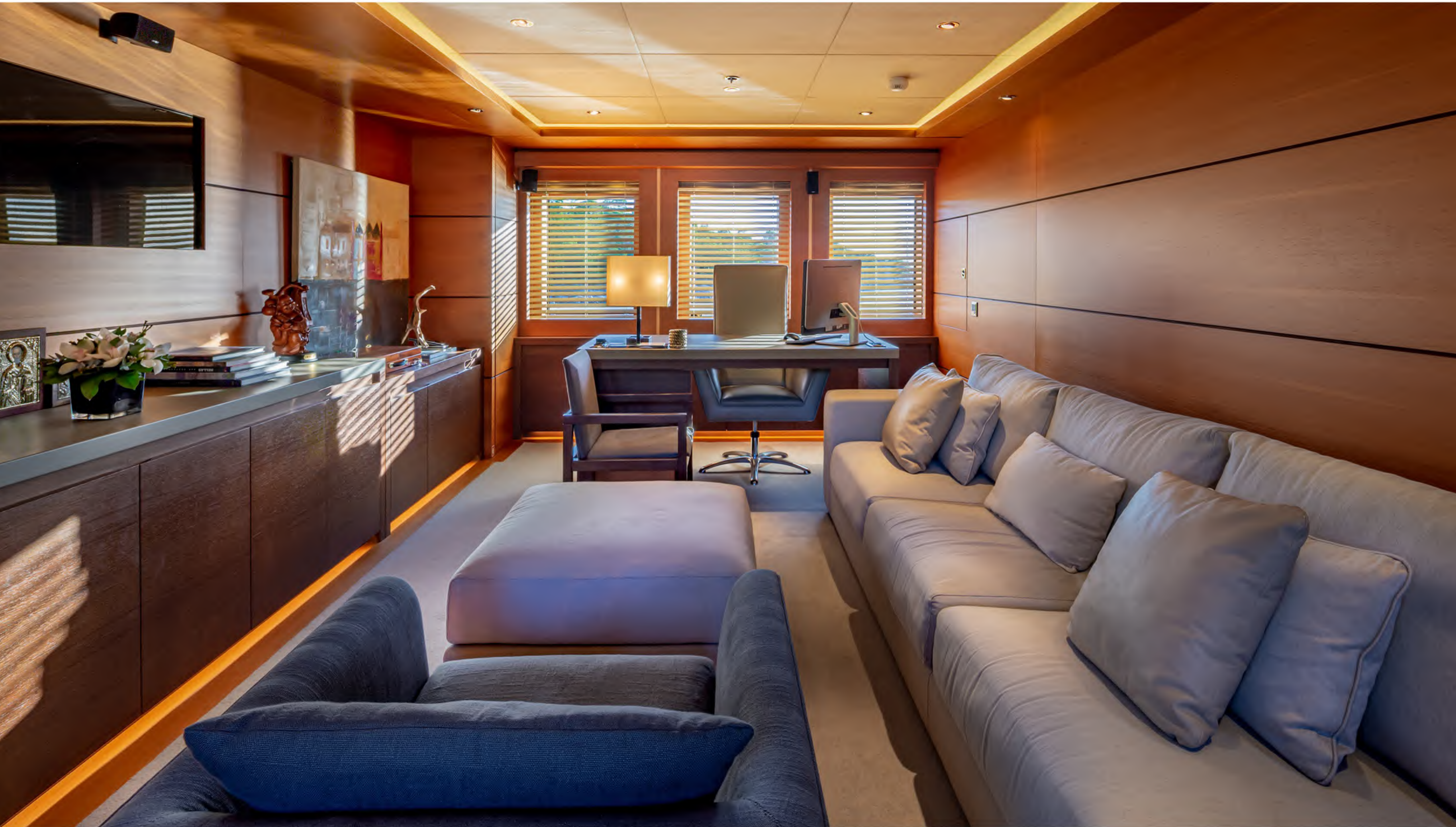
Private lounge area with an office, wine cellar, cigars humidifier and mini bar ■