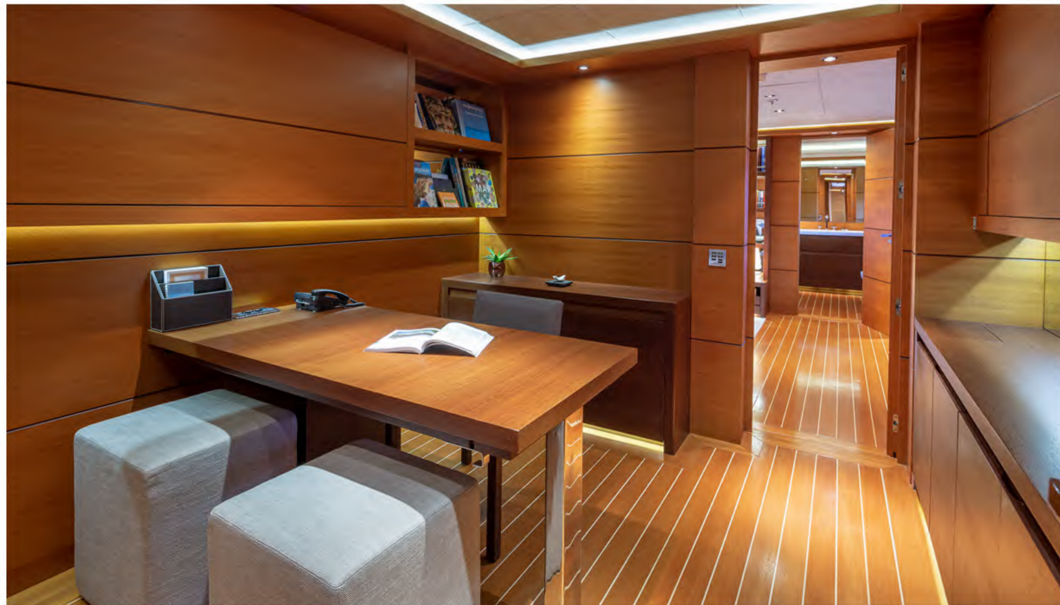
VIP Cabin walk in closet and office area