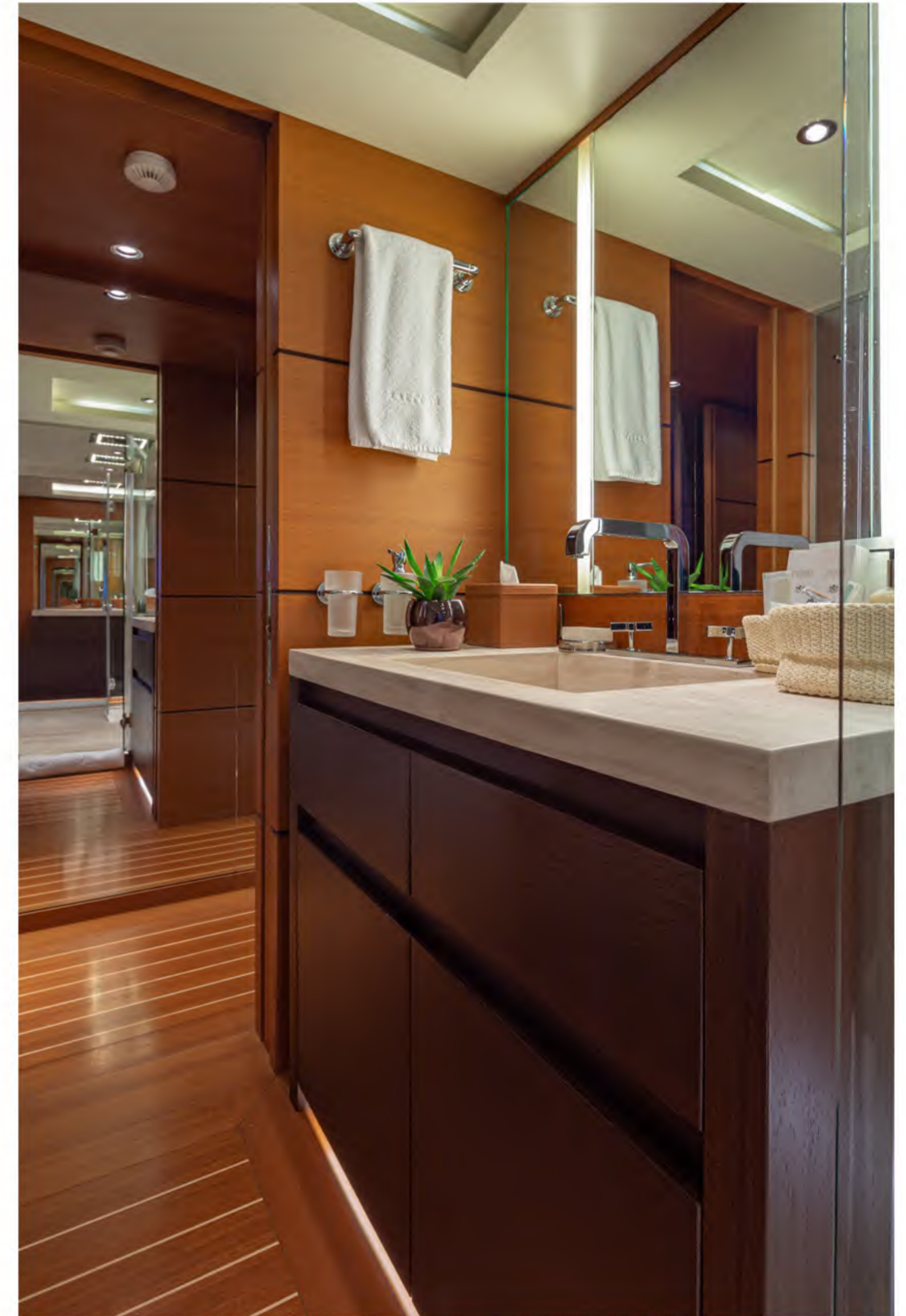
His and Hers en suite facilities, jacuzzi, shower & steam bath