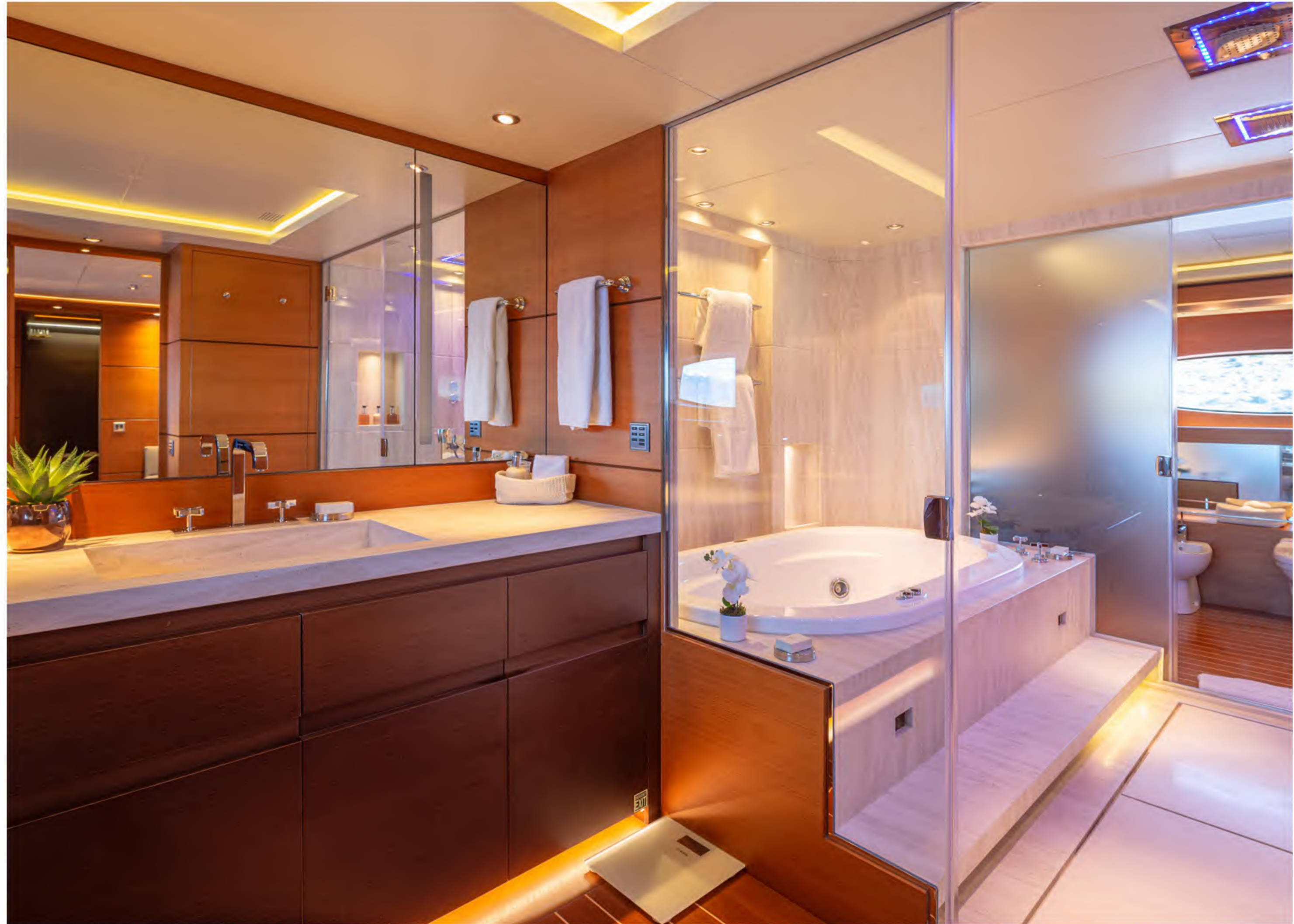
VIP his & hers bathroom, jacuzzi, shower & steam bath ■