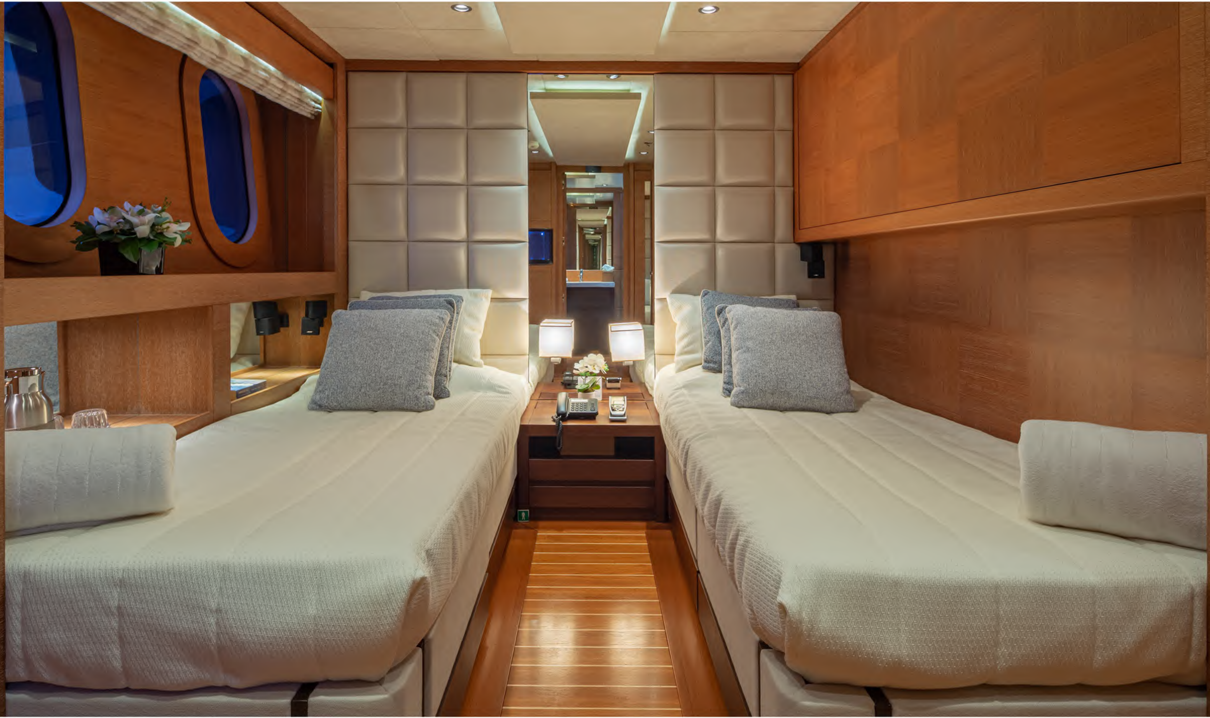
■ twin cabin