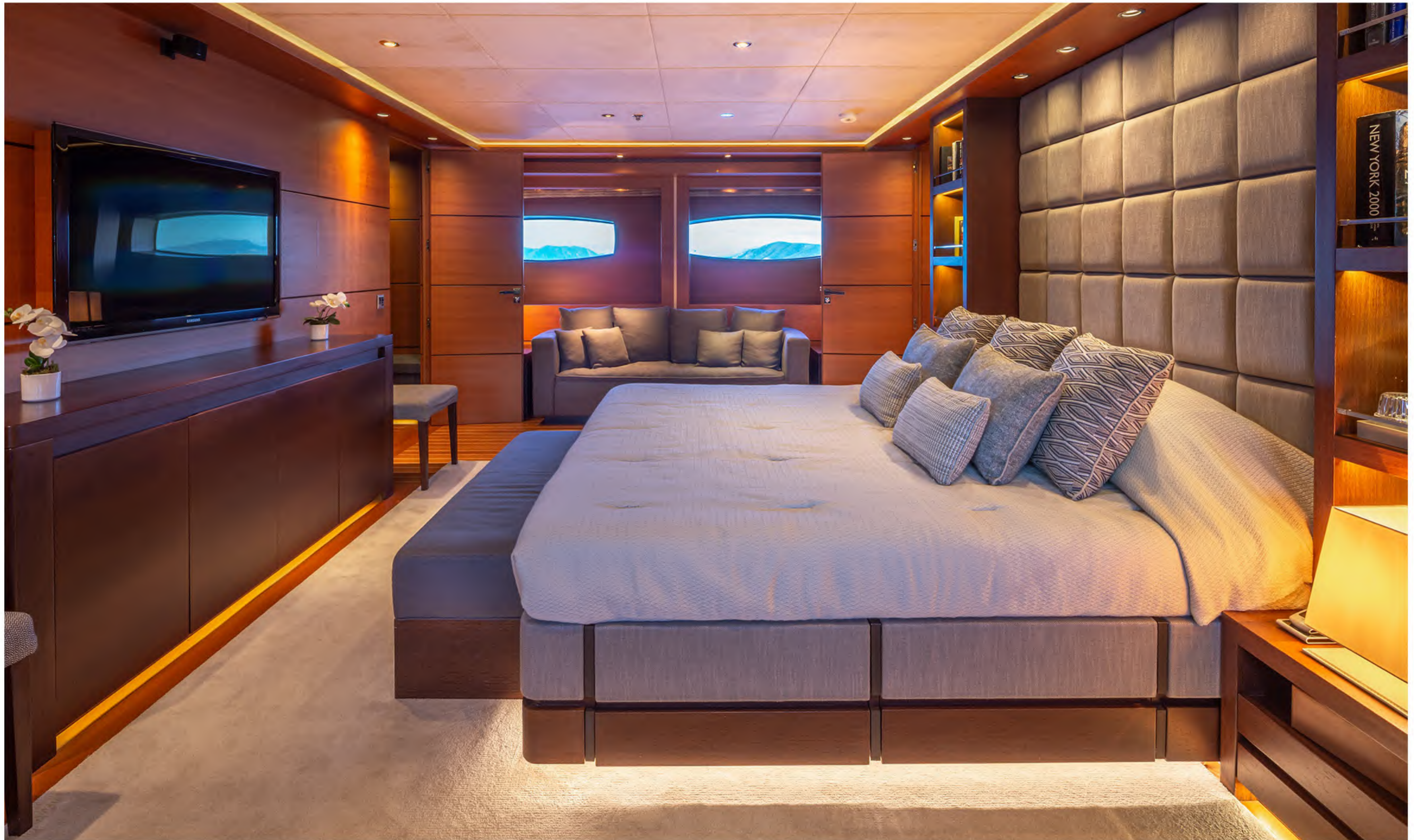
The beautiful full beam VIP cabin, with a king size bed, is located on the main deck and is like a second Master