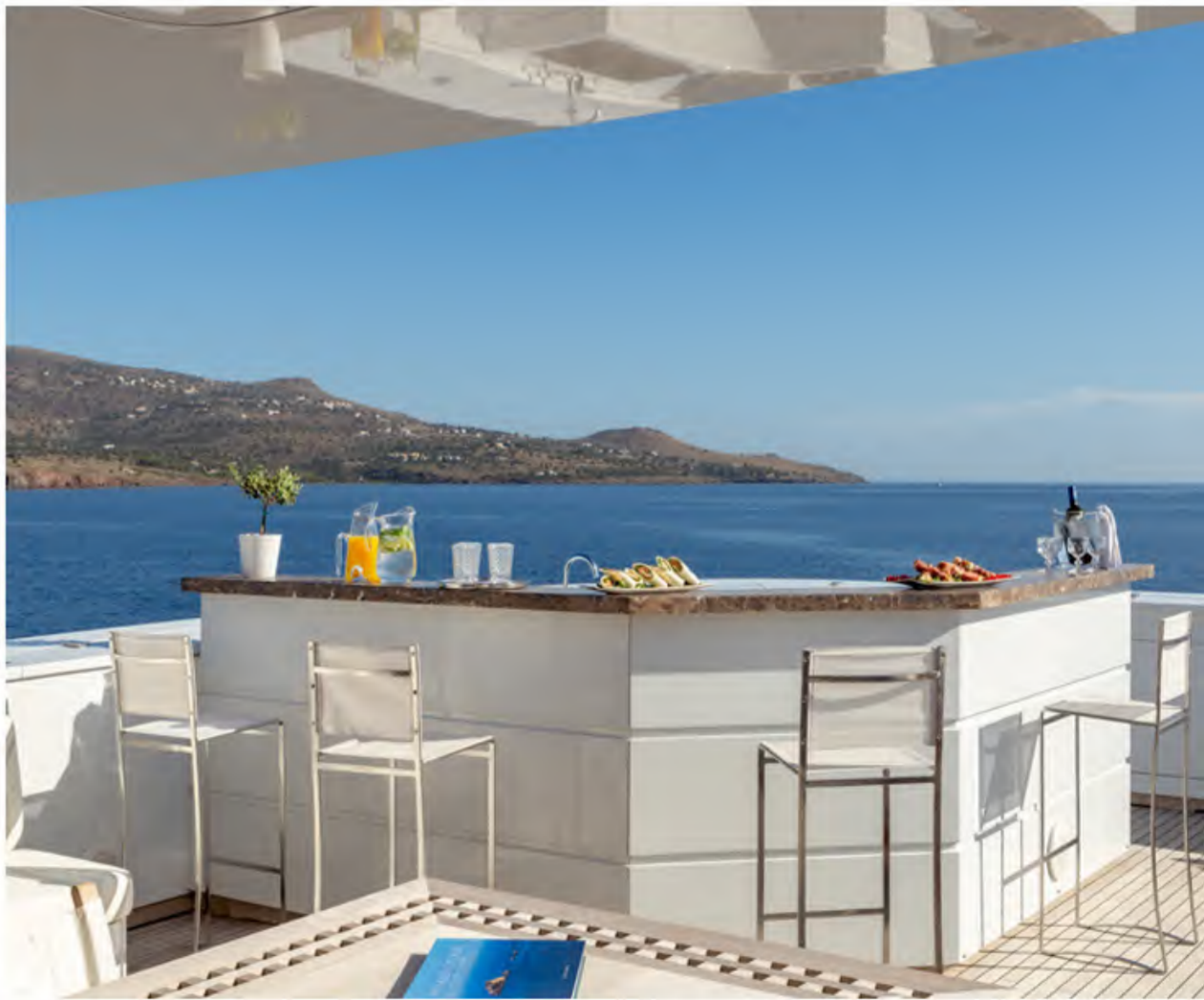
The magnificent and expansive sundeck hosts a large Jacuzzi, sunbathing area , beautiful lounge area , bar and al fresco dining able to accommodate up to 24 guests ■