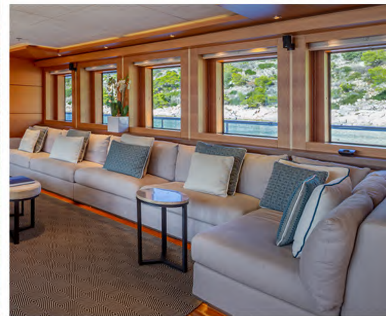
Fine woods incorporating with luxury materials and aesthetic lighting elements are giving ZALIV III a fabulous sense of space