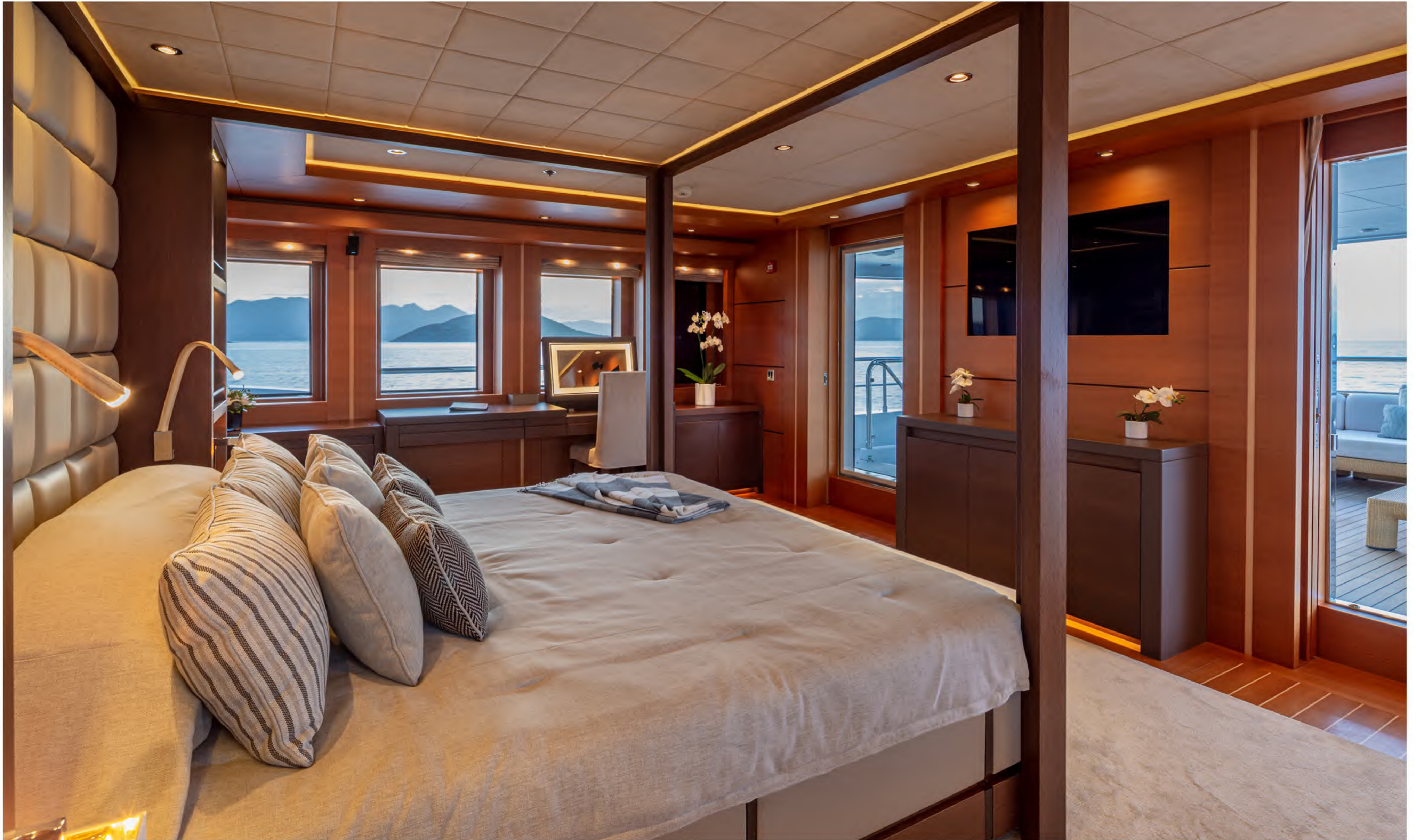
The sophisticated full beam Master Cabin is located on the upper deck offering unparalleled views & privacy ■