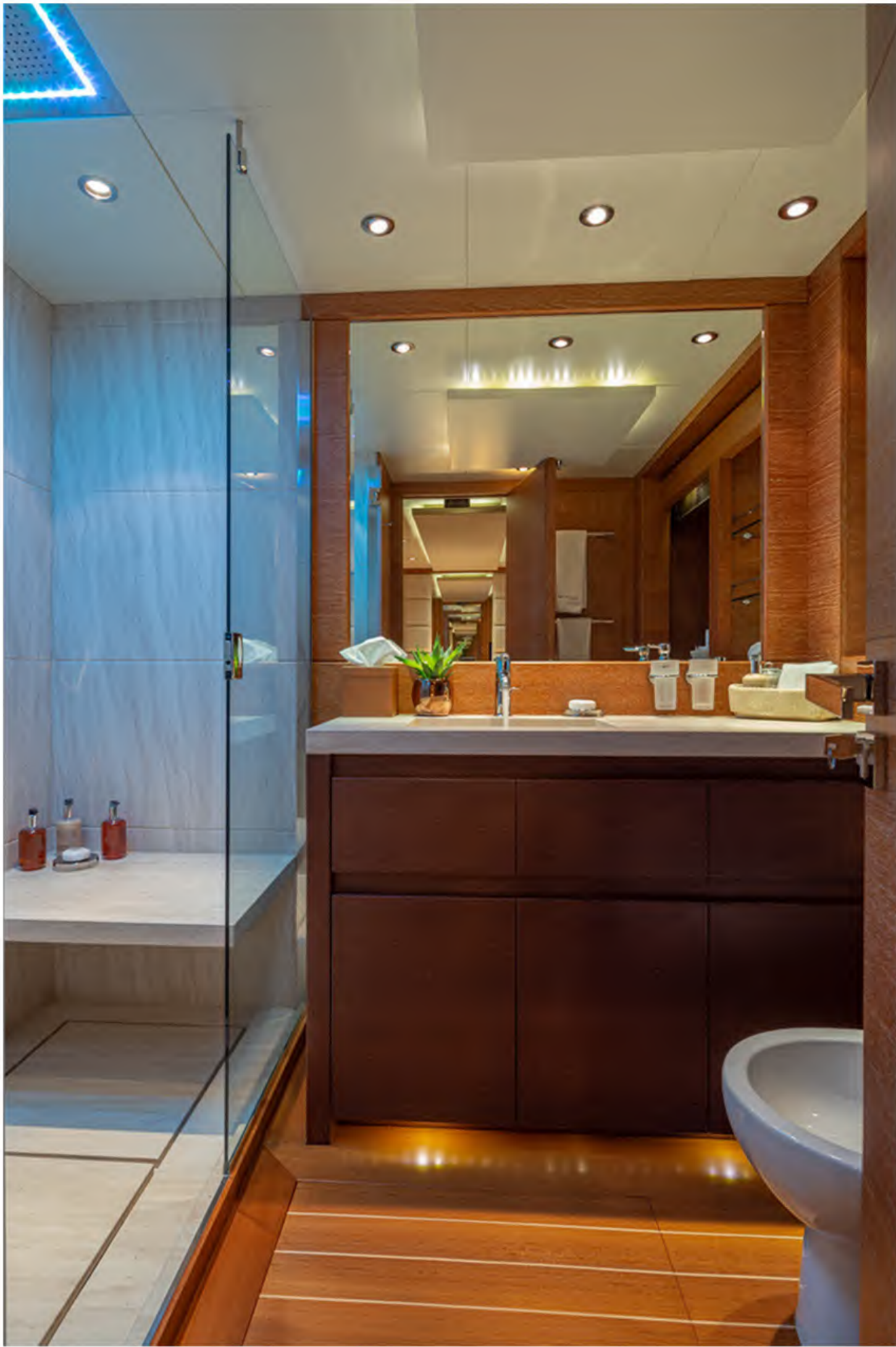
The two spacious twin cabins located on the lower deck offer a pullman berth each and ensuite facilities