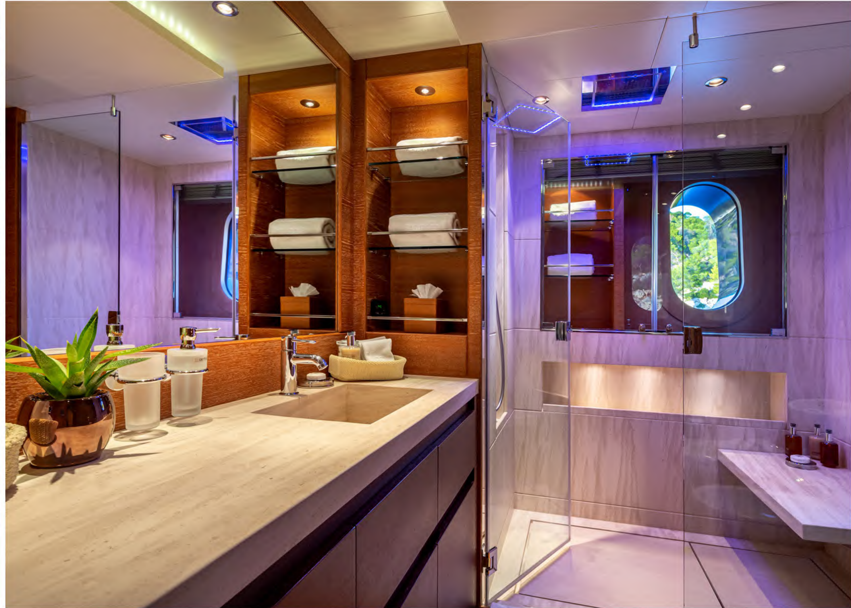
Two elegant double cabins are located on the lower deck, with a queen size bed and ensuite facilities with shower & steam bath