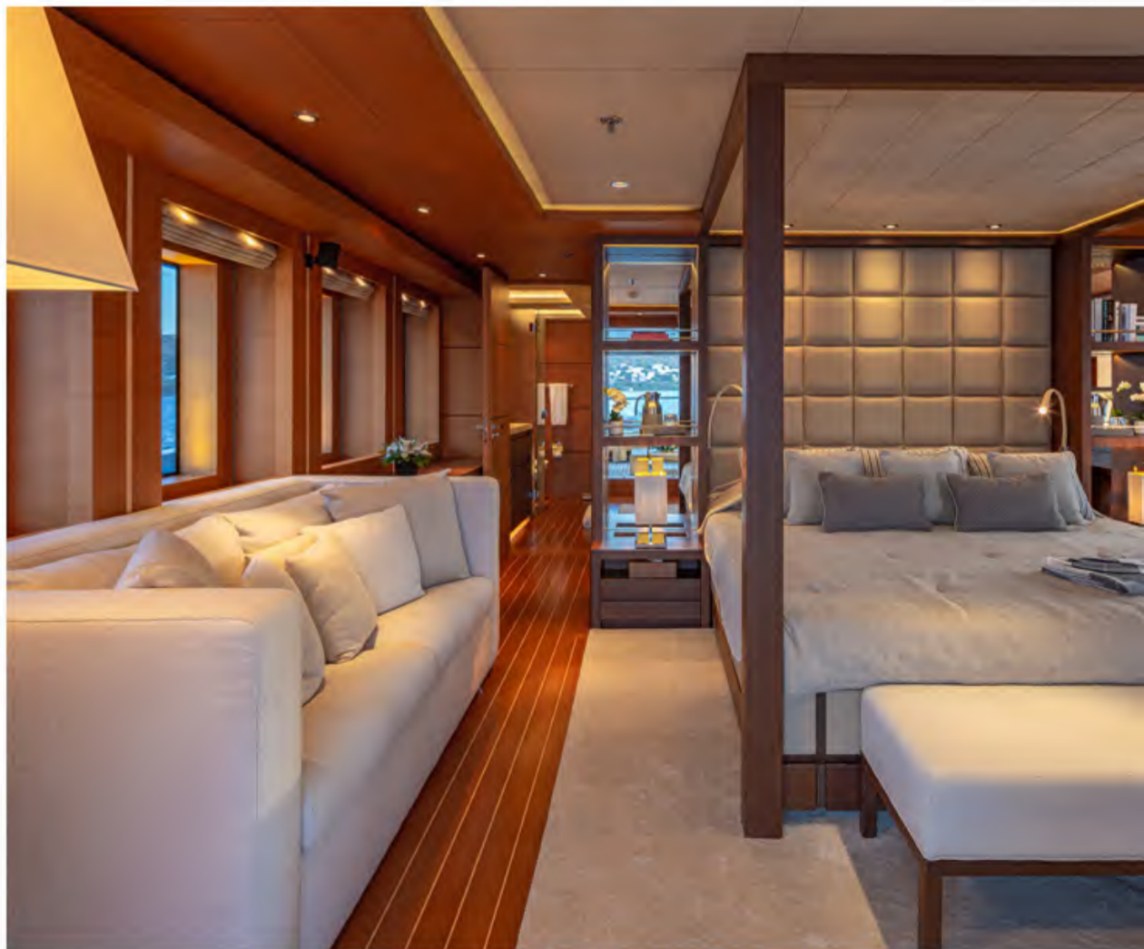
The Master Cabin features a king size bed, walk in closet and ensuite facilities