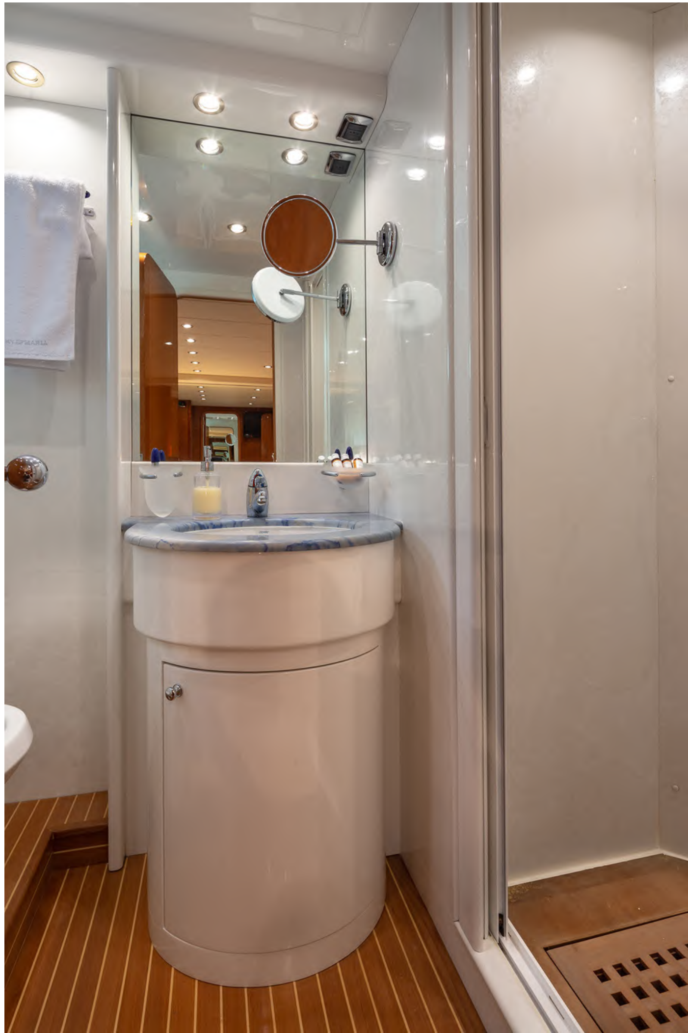
■ double cabin ensuite