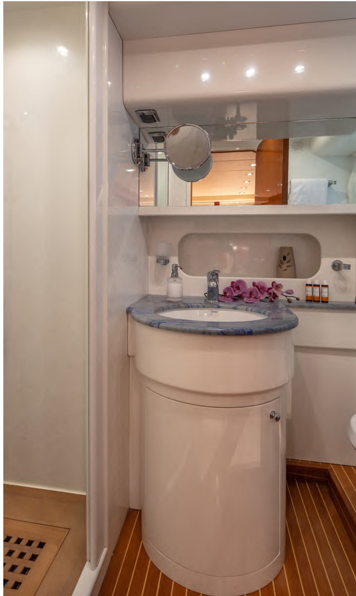
■ twin cabin ensuite