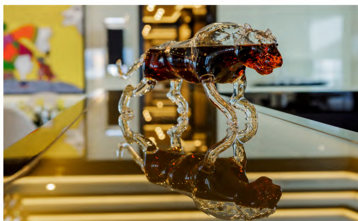
■ the bar