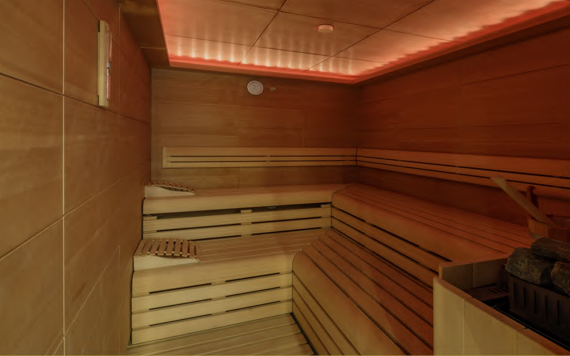
■ sauna & massage bed at beach club