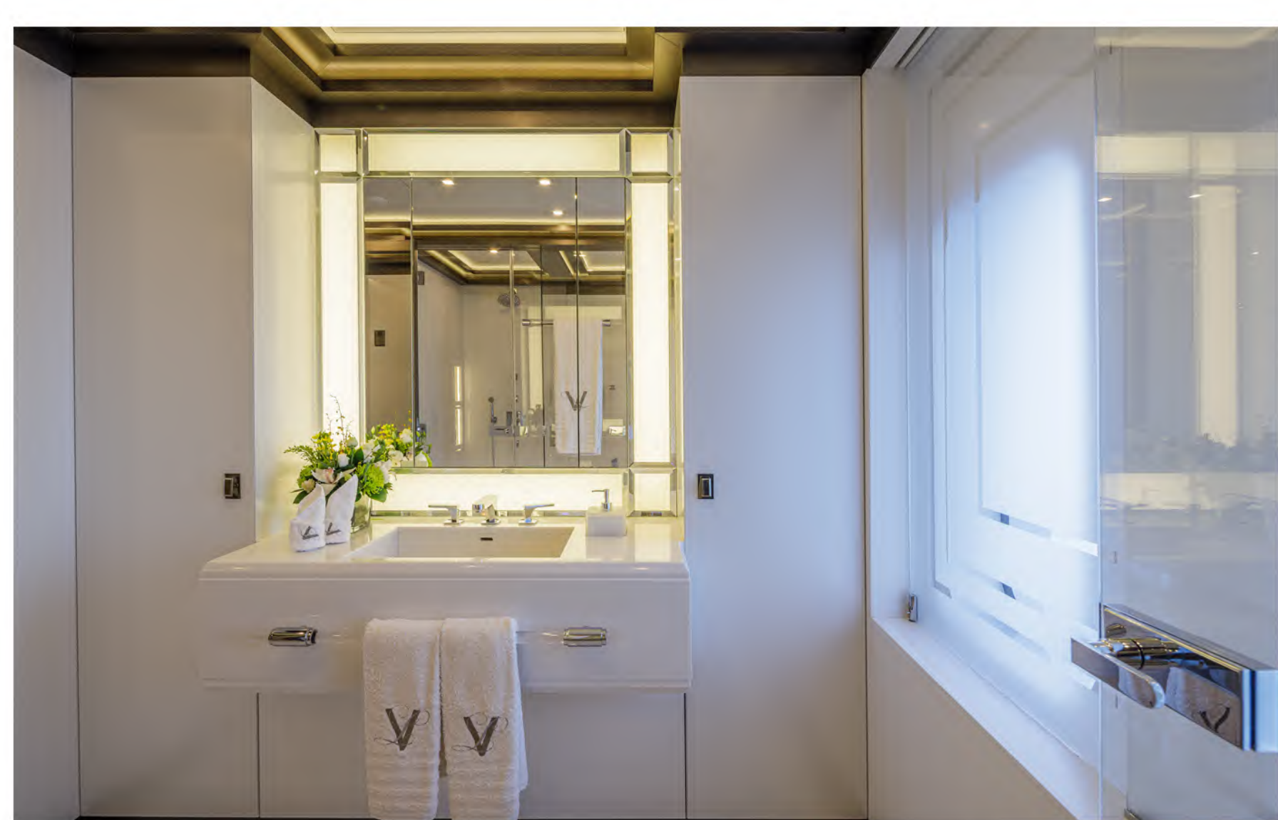
■ his & hers