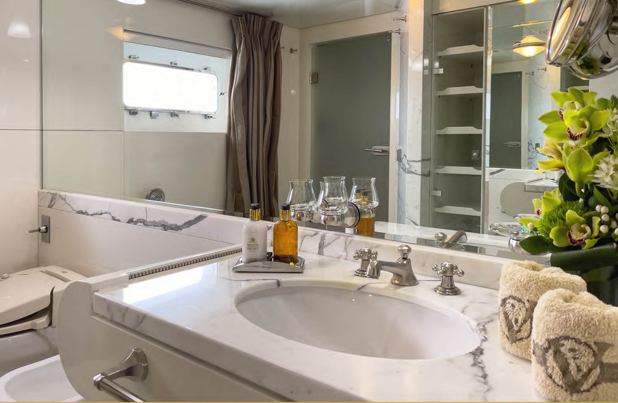
■ VIP cabin ensuite